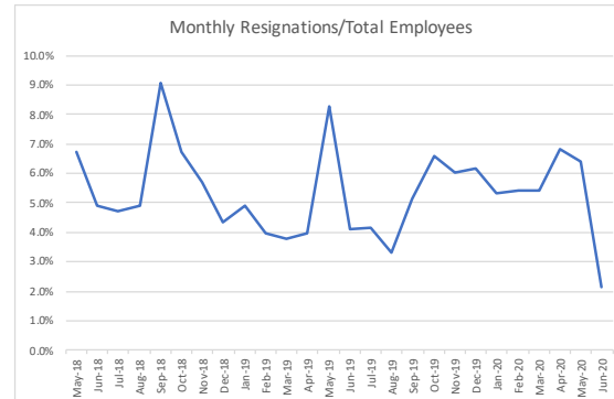
Table 7: Monthly Labour Turnover (%)